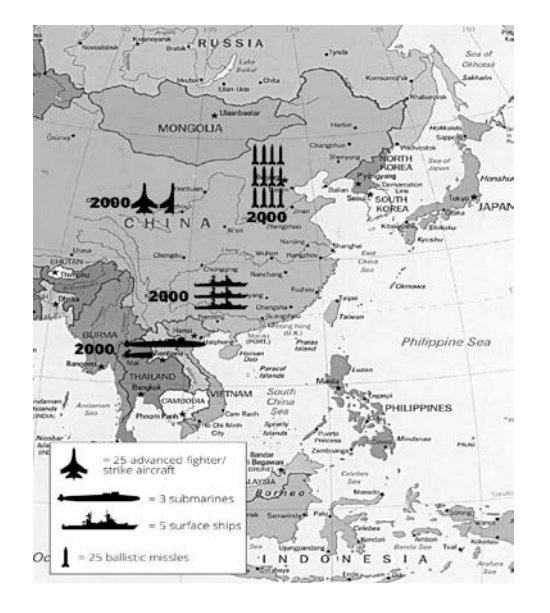
Figure 1: PLA military capabilities 2000